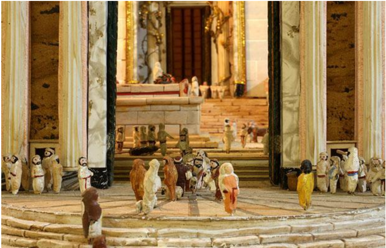
Mr. Garrard houses the 1:100 scale model of the temple in a large building in his back garden.